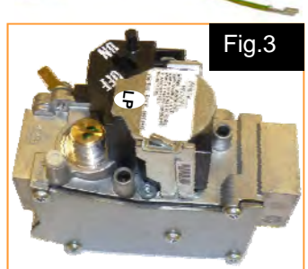
White Rodgers valve Propane Ambirad Part No. 202528

Burners fitted with the White Rodgers valve will be labelled with a generation code so that the valve can be identified for spares purposes.