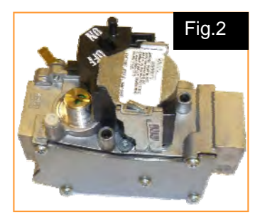
White Rodgers valve Natural Gas Ambirad Part No. 202404 ,

White Rodgers Mini harness Part No. 900515