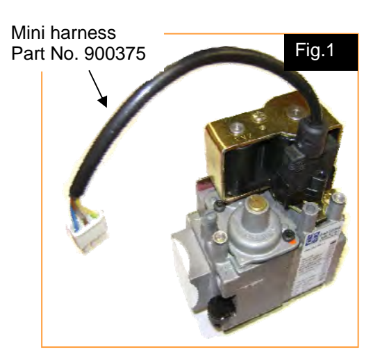
SIT 840 Sigma valve Ambirad part No. 201857 (Natural Gas) 201914 (Propane)

Due to ongoing improvements, the gas valves fitted to the Vision range of radiant heaters are being changed from the current SIT valve (Fig.1), to the new White Rodgers valve (Figs.2 and 3). The new valves are suitable for Natural gas and Propane gas types.