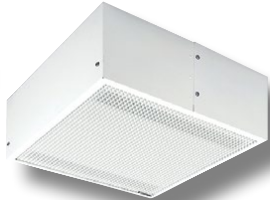
Surface mounted heater