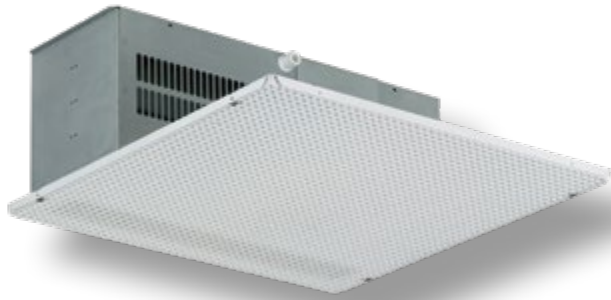
Recessed ceiling tile heater