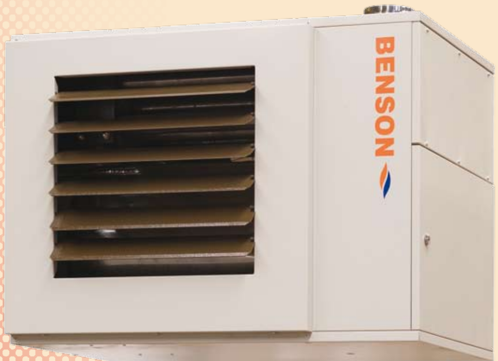
Axial Fan Oil Unit Heater

Comfort and Warmth When and Where Needed